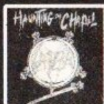
SLAYER "HAUNTING THE CHAPEL" 3 new songs from the one and only.