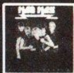
MAD MAX "ROLLING THUNDER" Another great German band in the tradition of Accept and Scorpions.