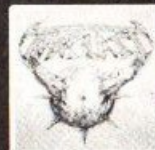
THRUST "FIST HELD HIGH" Mutilating metal from these Chicago heavies.