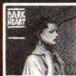
DARK HEART "SHADOWS OF THE NIGHT" Best new band from England.