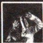
3RD STAGE ALERT Produced by guitar-wiz Yngwie Malmsteen.