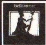
HELLHAMMER "APOCALYPTIC RAIDS" "There is NO band heavier than Hellhammer."