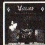
WARLORD "AND THE CANNONS OF DESTRUCTION HAVE BEGUN" Live video soundtrack from these masters.